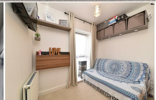
Brickdale House, Swingate Stevenage | SG1 1AS